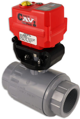
Type-27 Omni® Ball Valves Sizes: 3/8" - 2"