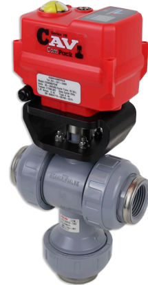
Type-23 Multiport® Ball Valves Sizes: 1/2" - 2"