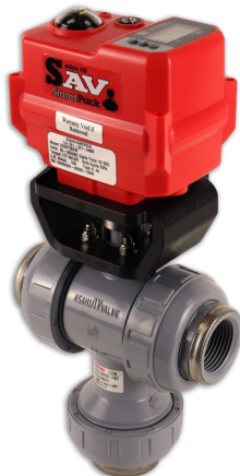
Type-23 Multiport® Ball Valves Sizes: 1/2" - 4"