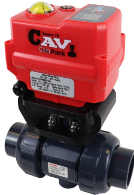
Type-21/21a Ball Valves Sizes: 1/2" - 2"