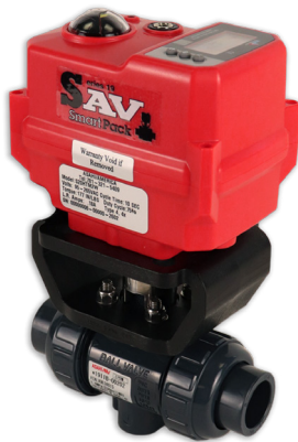
Type-21/21a SST True Union Ball Valves Sizes: 1/2" - 4"

Series 19 SAV Smart Pack® electric actuators can be factory-mounted on Type-21/21a and Type-21a SST ball valves, Type-23 Multiport® ball valves and Type-57 series butterfly valves. Choose from PVC, CPVC, PP, and PVDF valve bodies, and socket or threaded end connectors (ball valves). One part number for valve and actuator packages makes ordering easy. All actuated Smart Packs® are available in the four different models: on/off, modulating, failsafe, and modulating failsafe.