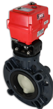
Type-57 Series Butterfly Valves Sizes: 1-1/2" - 6"