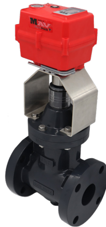
Type-C Gate Valves Sizes: 1-1/2" - 4"