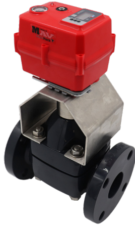
Type-14 Diaphragm Valves Sizes: 1/2" - 4"