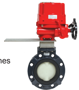
Shown with Type-57 butterfly valve

Voltages, Positioners, Transmitter, Explosion Proof Enclosure