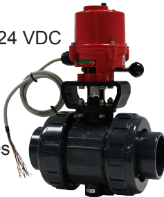
Shown with Type-21 ball valve