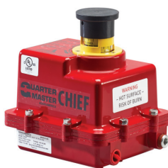
UL-508 LISTED ATEX Ex d IIB T4 UL-1203

Voltages, Auxiliary Contacts, Heater, Positioners, Transmitter, Explosion Proof Enclosure