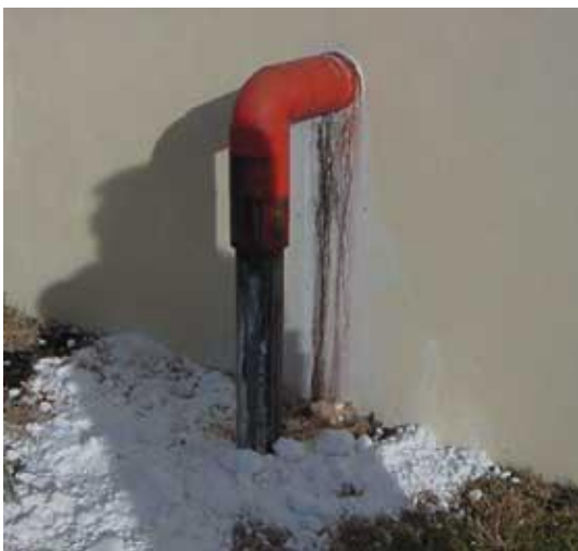
Figure 1: PVDF pipe failure due to the presence of sulfur trioxide.

In certain regions of the United States, 93 percent sulfuric acid has decreased in availability. However, the acid is readily available in 98 percent concentrations, as this concentration is a by-product of phosphate production. The reduction in availability of 93 percent acid, combined with the cost savings of using the more common 98 percent acid, caused many facilities to switch their acid supply from 93 to 98 percent. Many facilities running PVDF piping systems assumed that there would be no issue with using this acid in their pipelines.