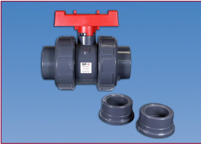
GP-V General Purpose Ball Valve